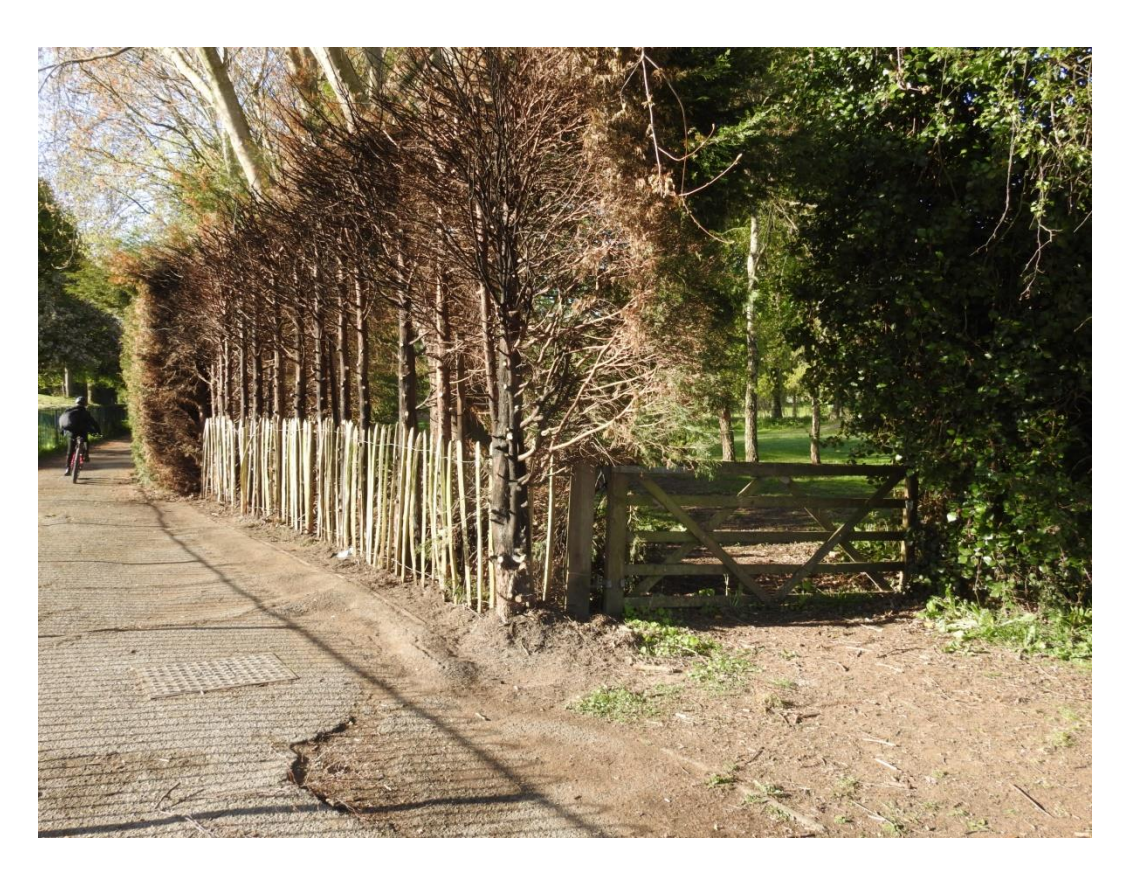
Repairs to the burnt Leylandii hedge