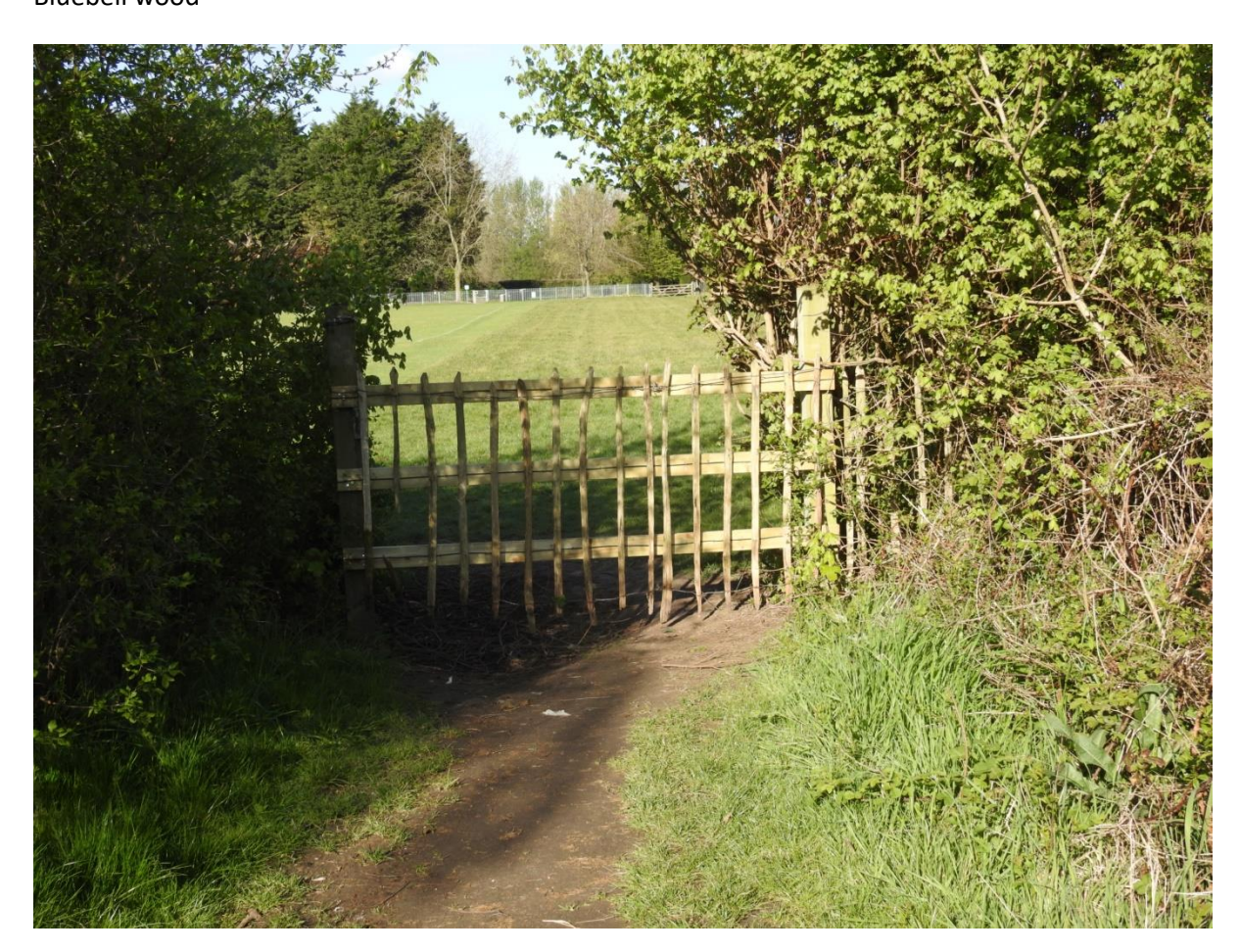
Fencing to deter dogs from the junior football pitches